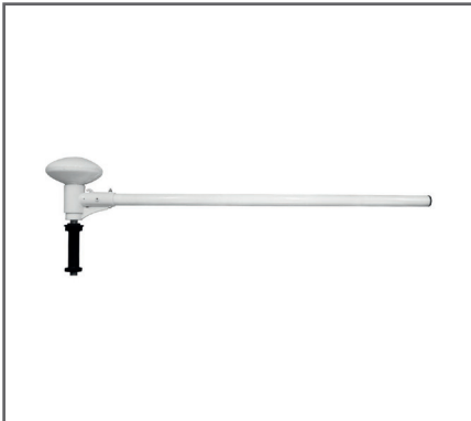
HEAVY DUTY SWIVEL ARM