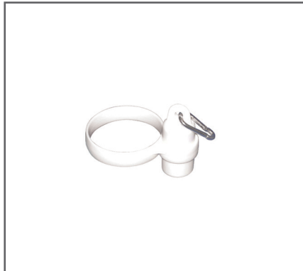
BOB WEIGHT & CARABINER