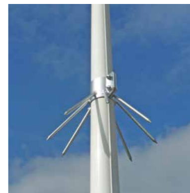
Anti Vandal Hedgehog