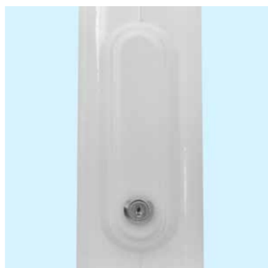
Plastic Door -Standard

If your flagpole is not in a secure location an internal halyard system (lockable door) is recommended. The door is located at the base of the pole (approx 105mm from base) and can be accessed with a key. To avoid interference with foundation bolts a ground collar can also be installed. If the flagpole is going to be installed in a public area, people climbing the flagpole can be a concern. The Hedgehog system was introduced by us to prevent this - please ask our sales team for further details.