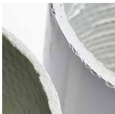
Glassfibre Wall Thickness Standard (Left) Heavy Duty (Right)