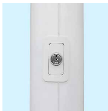
Metal Door - Optional