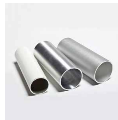
Aluminium Flagpole Finishes - Powder Coated (Left) Anodized (Centre) Satin Brush (Right)